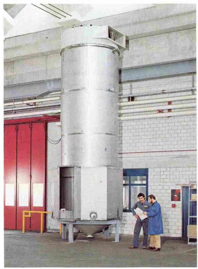
FUMEX condensate gas scrubber being assembled at the AIR FRÖHLICH Works in Arbon/Switzerland